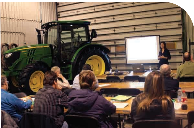
Tractor safety workshop participants take in training in St.-Hyacinthe, Québec.

UPA received $35,000 from CASHP for their project, with additional partner and community contributions of approximately $80,000. It was one of seven to receive funding in 2012–2013.