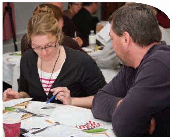
Amanda Campbell Photography 2013

Participants in FarmSafe Forum event in Nova Scotia hard at work during on-farm inspections training.