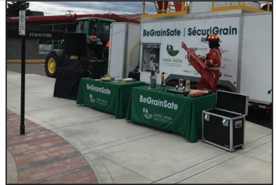
(Above): Clearwater Regional Fire Rescue Services prepare for BeGrainSafe training and demonstrations that took place in the heart of Rocky Mountain House.